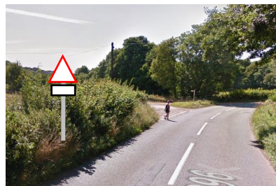
New warning sign position. 1. 'Horse and rider'/'For 130yds'