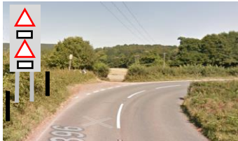
New warning signs position, on grey. 1. 'Peds in road'/'No footway for 200yds' 2. 'Horse and rider'/'For 130yds' 3. Vergemaster bollards, qty 2.