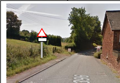
New warning sign position. 1. 'Peds in road'/'No footway for 200yds'