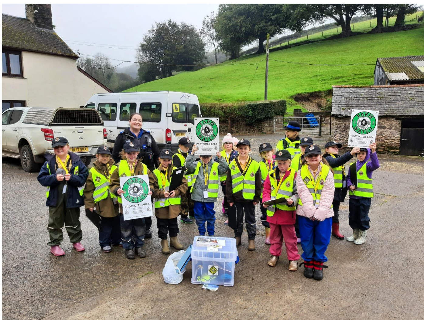
Photo of our old Mini Police group last year.